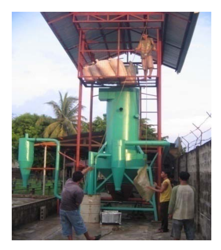
Figure 6. The CFRHG Model-80D Used for Drying Food Products in Tarlac City, Philippines