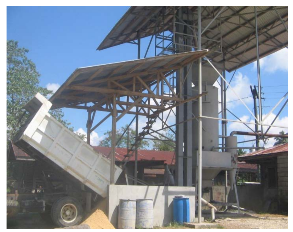
Figure 7. The CFRHG Model-100D Used for Baking Rubber in North Cotabato, Philippines.