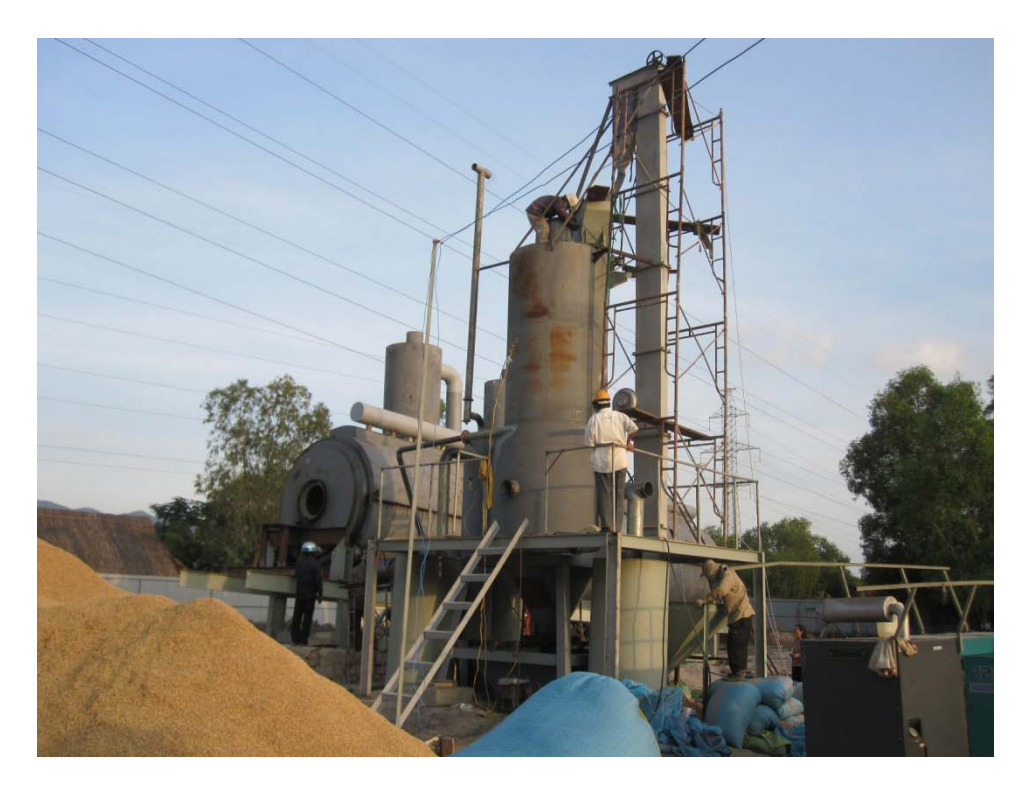
Figure 8. The CFRHG Model-120D Used for Torrefying Rice Husks in Vung Tau Province, Vietnam.