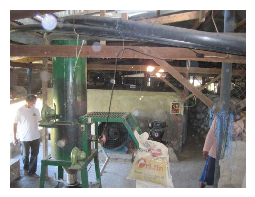
Figure 3. The CFRHG Model-40D Used for Drying Paddy Seeds in Nueva Ecija, Philippines.