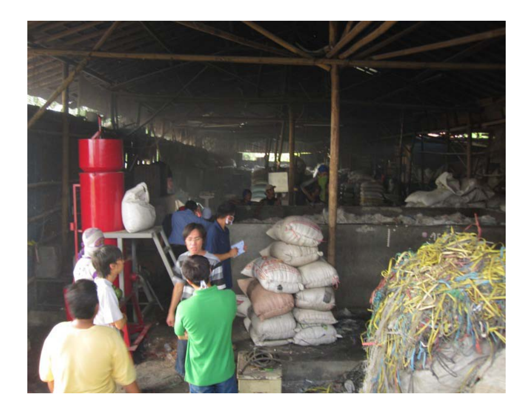
Figure 4. The CFRHG Model-45D Used for Drying Shredded Plastics in Tangerang, West Java, Indonesia.