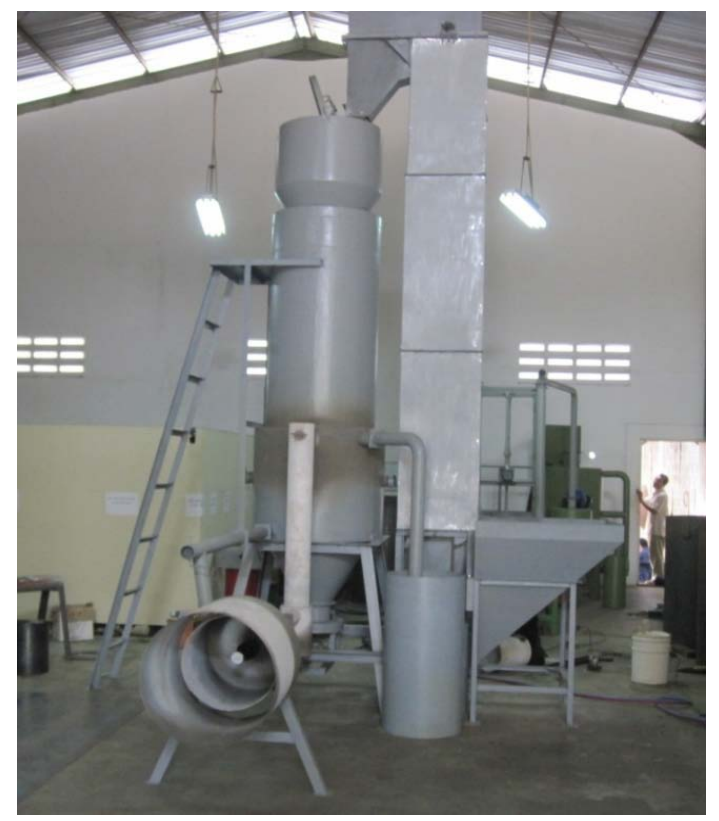
Figure 5. The CFRHG Model-60D Used for Paint Factory In Tegal City, Central Java, Indonesia.